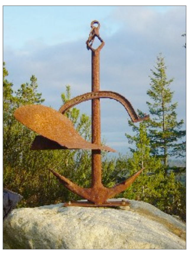
An association of all Hope Alive Trained Counsellors worldwide