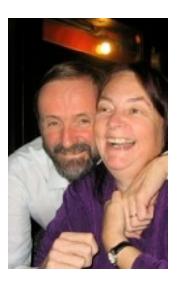
Colleagues from Switzerland

IHACA needs you to continue doing groups and helping prevent. heal and treat damaged individuals.