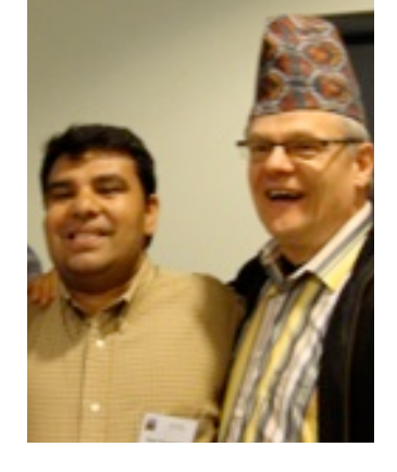
Colleagues from Nepal and France

IHACA needs you to diligently send 10% from your group earnings, so we can continue to give scholarships and travel grants to qualified training applicants and counsellors who want to join our Annual General Meetings worldwide