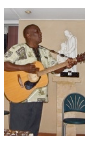
Colleague from Africa

IHACA needs you to continue doing groups and helping prevent. heal and treat damaged individuals.